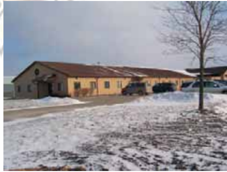
Consolidated Vocational Site in Indianola