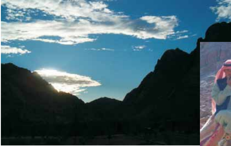
Area of Mt. Sinai

"This is the day the Lord has made, let us rejoice and be glad in it." Psalm 118:24