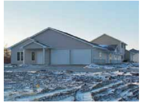
Recently Constructed HCBS Home in Indianola

Three new building projects in the past year will help Christian Opportunity Center to carry out its mission and provide quality residential and vocational support for people with disabilities. The largest project was a consolidated vocational training and administrative office site for the Indianola Region (about 15 minutes south of Des Moines). COC has maintained a presence in Indianola since 1994 when it opened two homes for people with disabilities. In 2002, COC acquired the Winifred Law Opportunity Center. With the acquisition came two vocational training sites in a community of 13,000 people, in addition to the site already operated at COC. Construction