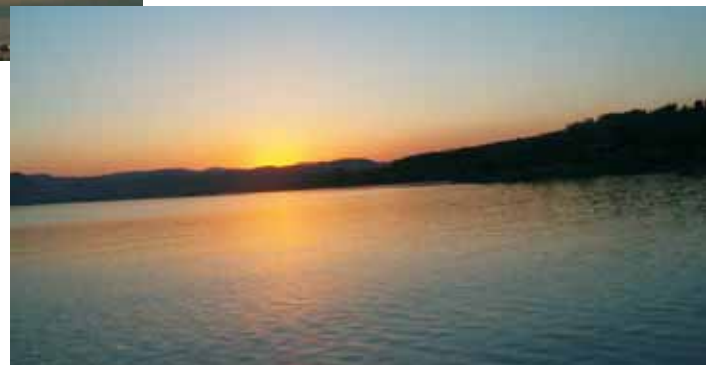
Evening on the Sea of Galilee

"Abide with me, fast falls the eventide; the darkness deepens, Lord with me abide..."