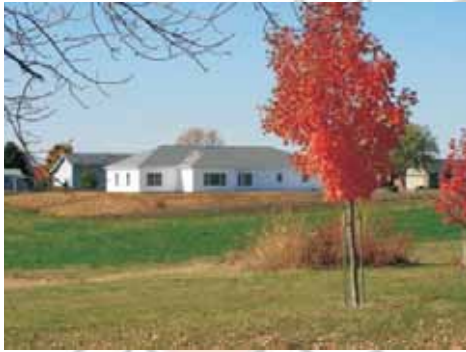
New HCBS Home in Pella